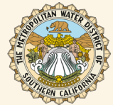
THE METROPOLITAN WATER DISTRICT OF SOUTHERN CALIFORNIA